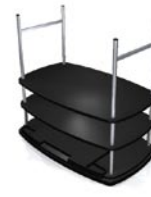
Fold legs and place in convenient case.