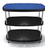
Slide shelves together to rest against top.