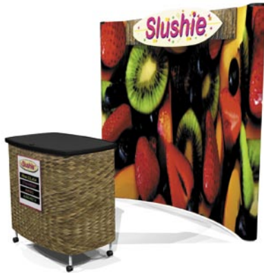
Stratus table with optional casters for easy positioning and custom graphic panel. Casters add 3" (7.6 cm) to total height.