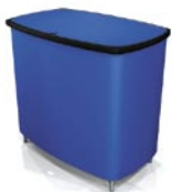
Simply unattach and roll the single panel.