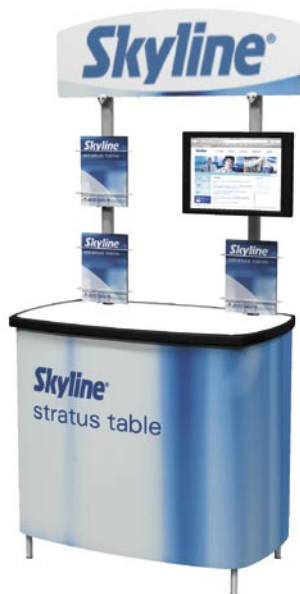
Two accessory poles allow for multiple accessories and a graphic header.